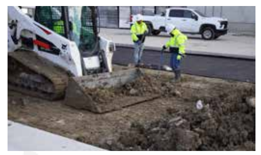
Excavate to depth of base and PRO PLUS