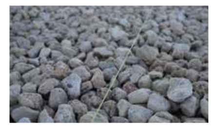
Compact and level base.