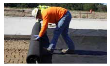
Place Geotextile fabric and pin overlaps.